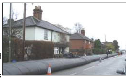
East end of Aquadam near Chertsey Bridge 'The Chertsey Sausage'

5 Local Leadership - Consideration should be given to the co-ordination of Flood